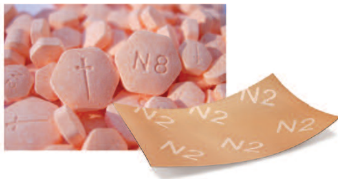
Photos of brand name-products are for informational purposes only and do not imply endorsement by the New York City Department of Health and Mental Hygiene.